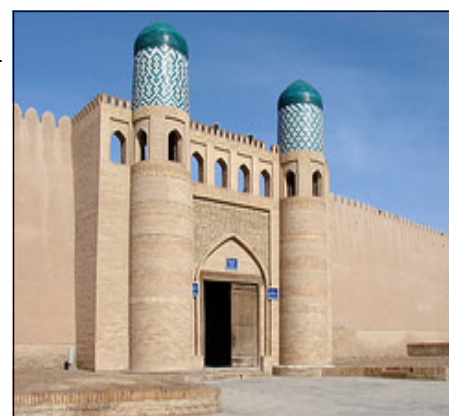
Gates of the Khyva fortress.

Monday to Wednesday was focused on lecturing and discussions at Urgench State University. A group of teachers, researchers as well as 8 students aspiring to join the new master programme took part. Most remarkable was the official opening of the Uzwater Centre at Urgench State University. It included a demonstration of the laboratory equipment to be used for studying water and soil, an exhibition of paintings from the University's art school, and the presentation of new books for the library of the centre. And, of course, a toast for the future success of the new centre.