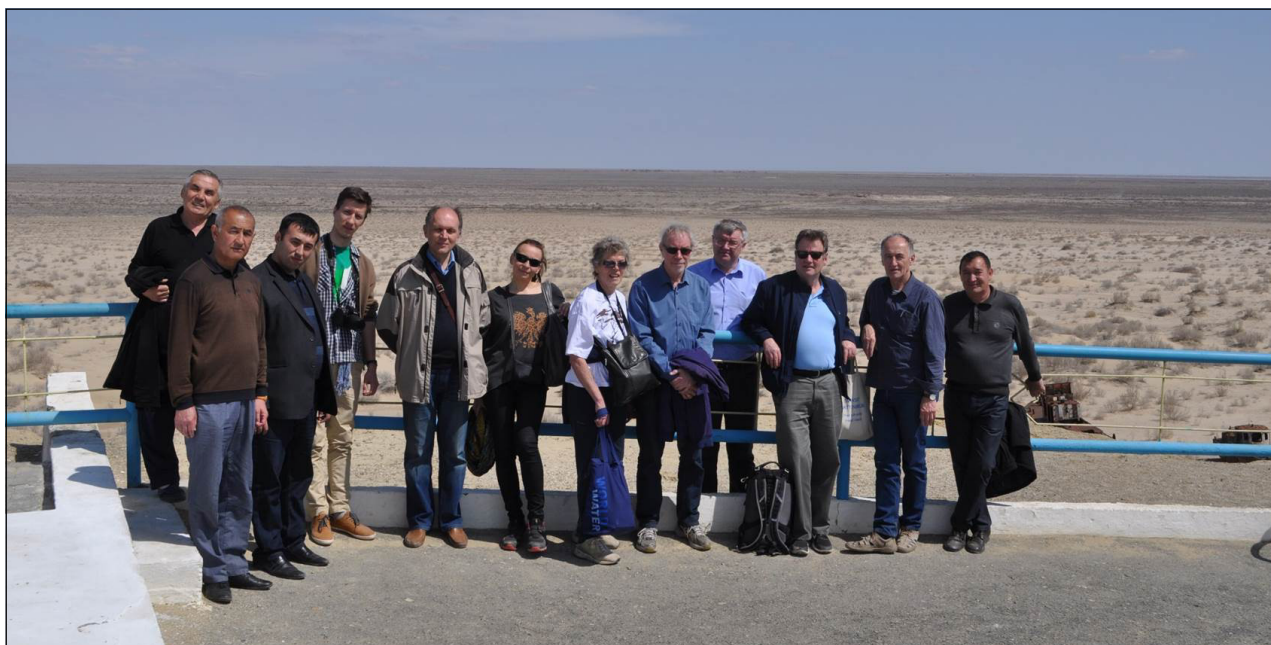
The Uzwater team at the remains of the Aral Sea.