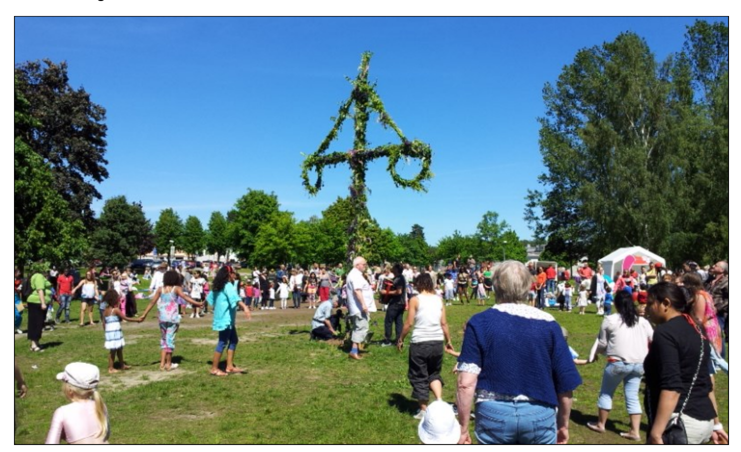
Midsummer in Haninge, Sweden.

Summer is coming and at least in Sweden and in the Baltic Sea region countries Midsummer is an important holiday during which we enjoy and celebrate the return of light and warmth. We understand that it is not the same in Uzbekistan where the temperature may be more of threat than a blessing. Nevertheless we wish you all a nice summer with much work for Uzwater and hope for important steps forward when the 2015 fall semester begins.